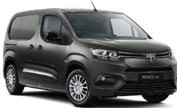
Dark Grey (EVL)