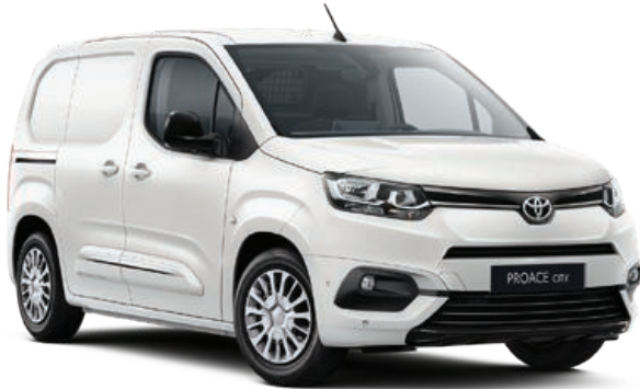
Icy White (EPR)